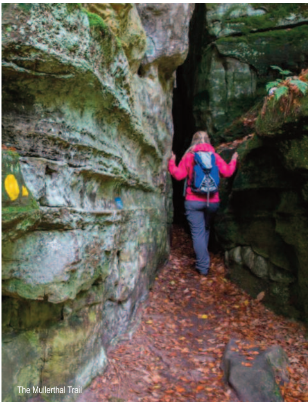
The Mullerthal Trail

For the younger travellers, the Red Rock Mountain Bike Trail guides cyclists on the traces of Luxembourg's industrial and historical past through former open iron ore mines in protected nature reserves. A guided tour of the National Mining Museum in Rumelange should