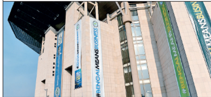
Preparations for the summit at the main auditorium (top) of Biswa Bangla Convention Centre (above) on Tuesday

journey from the conceptualisation stage to industry readiness & further commercialization, and would deliberate on how Bengal and Britain can partner in each of these stages," added sources.